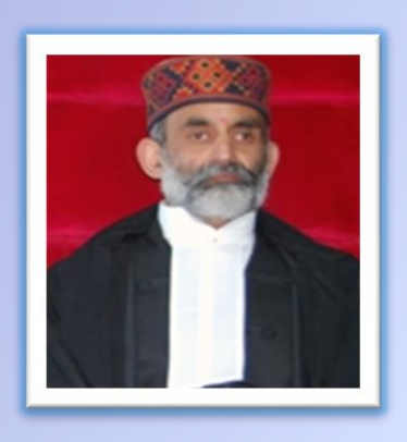
Hon. Mr. Justice Vivek Singh Thakur Hon'ble Judge High Court of Himachal Pradesh